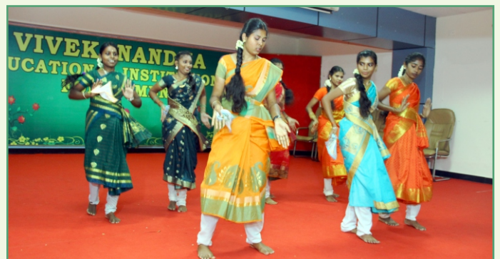
Student-teachers presented their cultural programme as thanks giving to their teacher-educators on the occasion of Teacher's Day Celebration on 05 th September, 2017.