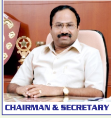
CHAIRMAN & SECRETARY